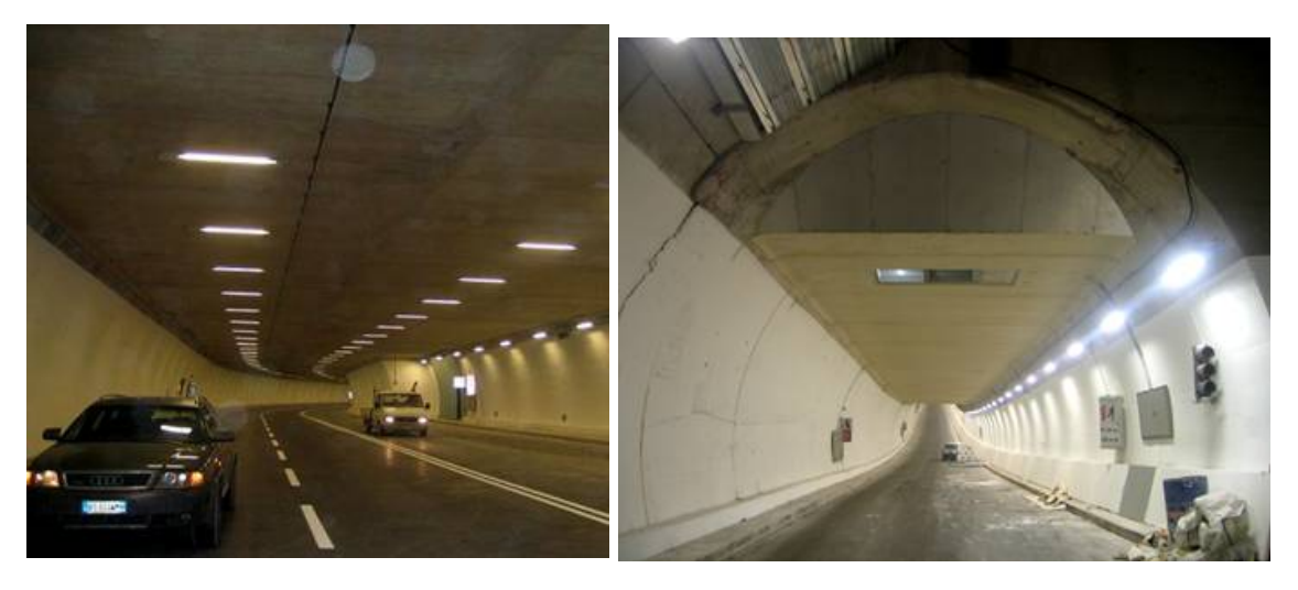
View of central part of tunnel